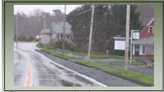
Hull's Cove - Opposite Direction from Above