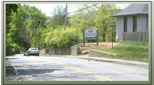
Hull's Cove School House Existing