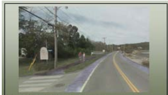
Hull's Cove Sidewalk to Service Colony Motel