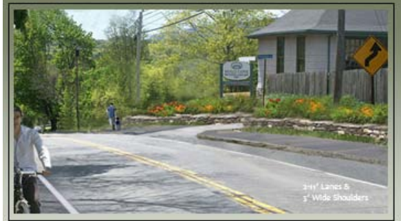
Possible Treatment: Low Stone / Granite Block Wall and Planted Slope